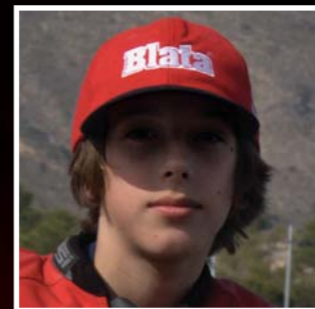
Radek Sokol european champion 2008